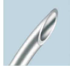
Polished inner bevel edge minimizes the risk of catheter shearing