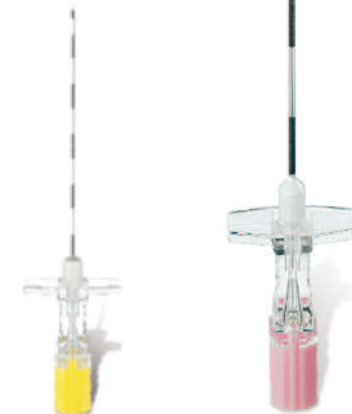
Perican® Paed – Tuohy pediatric epidural needles