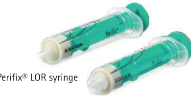
Perifix® LOR syringe